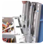
Fan bar with anti-vibration rubbers