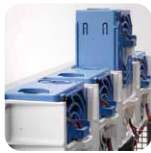
Tool-less 4 x middle 80mm hot-swap fans