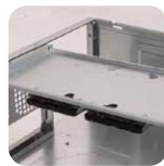
Optional bracket for 1 x internal 3.5" HDD or 2 x internal 2.5" bays