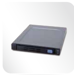
Slim FDD or 2.5" HDD with SK51101