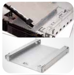
Tool-less lock for slim FDD or 2.5" HDD kit